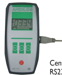
Centor First XZ with RS232 output