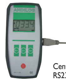
Centor First XZ with RS232 output